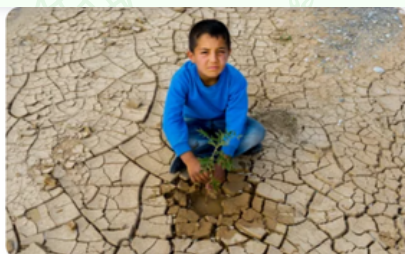
The Red List of Ecosystems for Assessors – Specialised Course

Link: https://www.worldwildlife.org/pages/tnrc-ecourse-introduction-to-corruption-anti-corruption-and-natural-resource-management